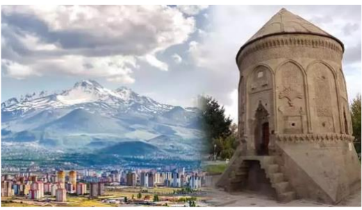
Erciyes and Doner Kumbet