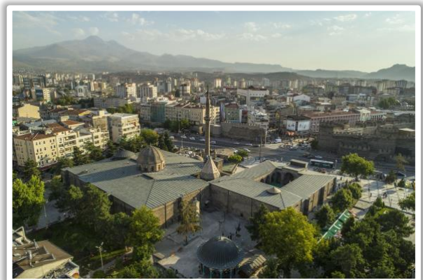
Hunat Hatun Complex