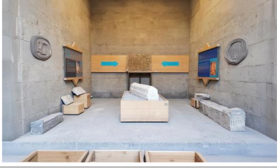
Medical / Madrasa Complex (Early 13th Century)